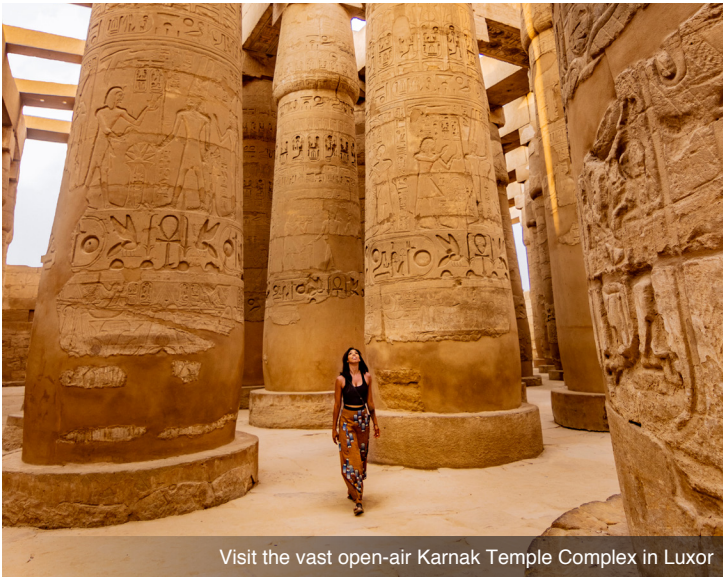
Visit the vast open-air Karnak Temple Complex in Luxor