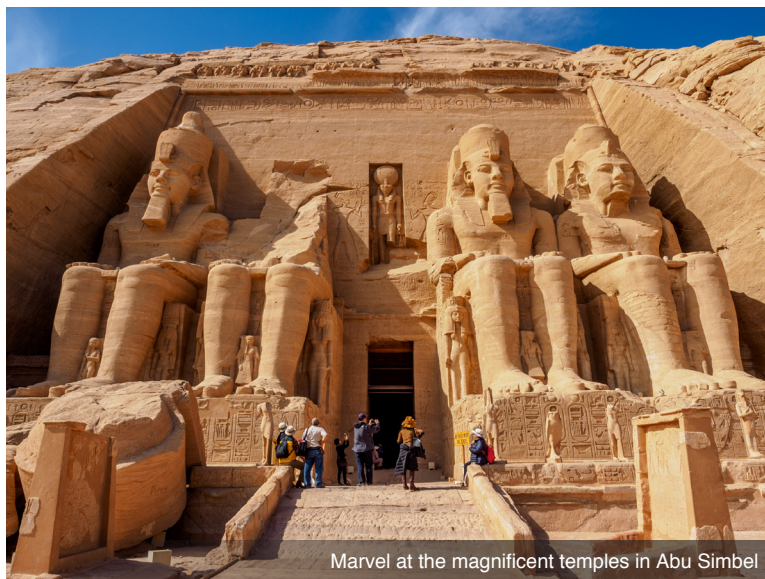
Marvel at the magnificent temples in Abu Simbel

Egypt, but it is the second largest after Karnak. In the afternoon, sail to Kom Ombo, a pleasant agricultural town and home to many Nubians. Visit the unusual Temple of Kom Ombo dedicated to both Horus and the crocodile god Sobek. After re-embarking, the ship sails for Aswan. Relax on the Sun Deck as you cruise along the Nile. This afternoon, enjoy a cooking class onboard. Meals: B, L, D