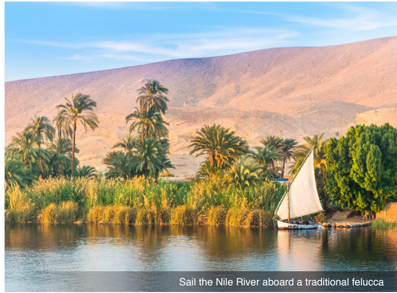
Sail the Nile River aboard a traditional felucca

DAY 1 Depart the USA: Depart the USA on your transatlantic overnight flight to Cairo, Egypt.